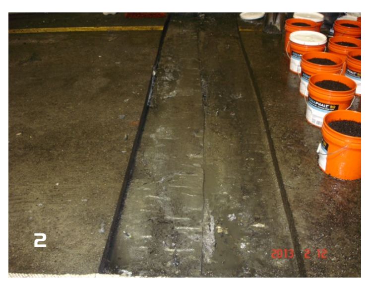
Figure 2: Prepped Area Ready to Lay Aquapahit

Leaking joint stopped the best we could, but as you can see less than Ideal conditions for asphalt with wet dirty conditions. In a lot of cases there was still standing water in these areas. I was skeptical at first whether the Aquaphalt would stay in these patches but it stayed in and the more we did the more confidence I had with this product.